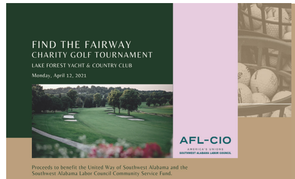
Proceeds to benefit the United Way of Southwest Alabama and the Southwest Alabama Labor Council Community Service Fund.